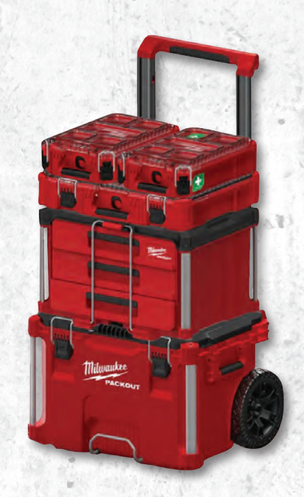
*Additional items to add to order