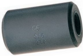
S-409 Swage Buttons